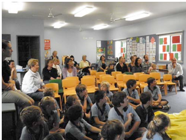
Picture: Some of the parents who attended the Easter activities.

It was also nice to have a good roll-up for the scripture service. Our scripture teachers devote a lot of time to their classes and it is nice for them to see the interest from parents in what is happening.