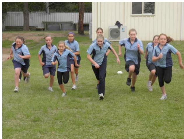
Picture: Off and racing in the 12/13 years girls' cross country. Notice the elbows are out to make a bit of room!