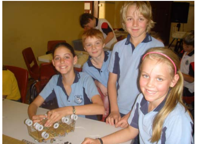
Olympics Day in Dungog