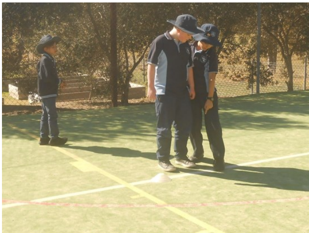
Year 3 students stepped in as fitness leaders while 5/6 were in Canberra.