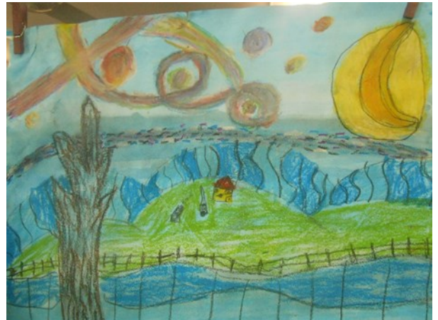
The best part about studying Van Gogh's artwork is learning how to pronounce his name.